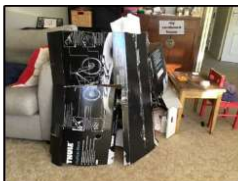
Grace's cardboard house