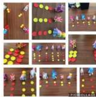
Etta playing a Maths card game with Mum