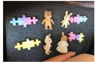
Luella sharing (division)