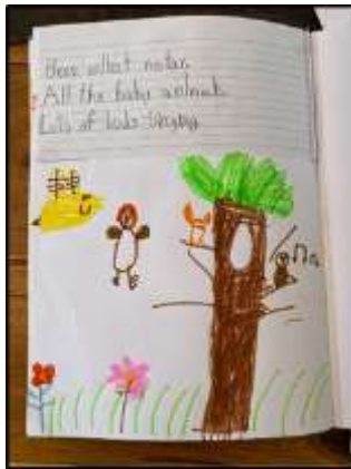
Jarli's Haiku Poetry