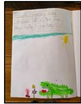
Jarli's Haiku Poetry