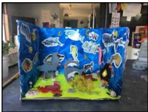
'Sea life' from Aihlinn

There has been lots of GENIUS creation coming from our Inquiry project in the last couple of weeks. It's amazing what inspiration a simple cardboard box can create.