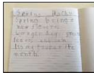
Raffy's Spring Haiku Poem