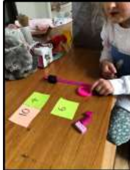
Nika adding numbers