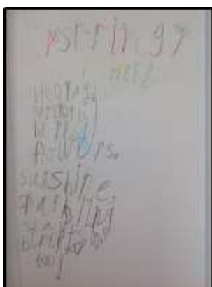
Priti's Haiku Poetry