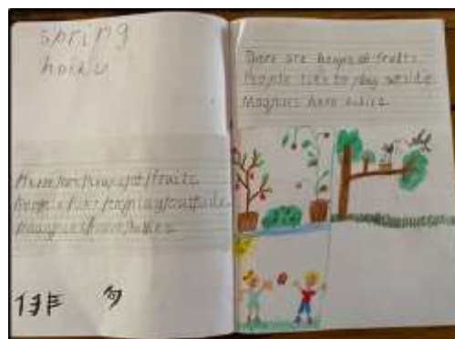
Clancy's Haiku Poetry