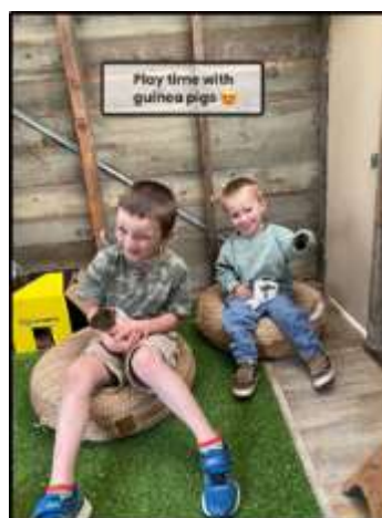
Ned's two new family members.