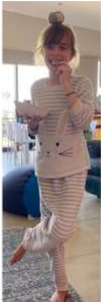
# schools got talent