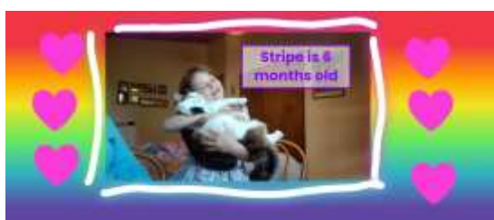
Emily and Stripe