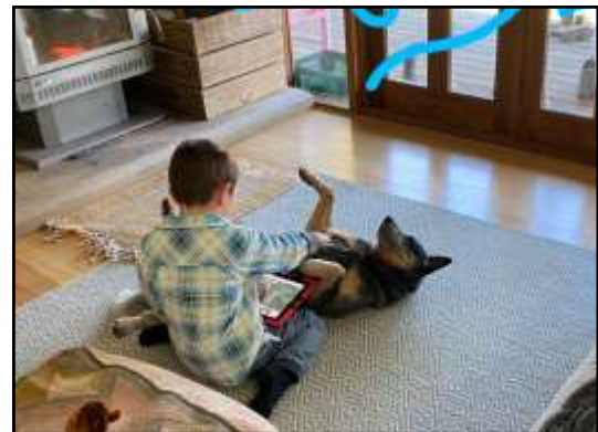
Ned and Dusty

The last couple of weeks we were looking at adjectives and verbs in some of our stories. Pet Share presented quite a few.