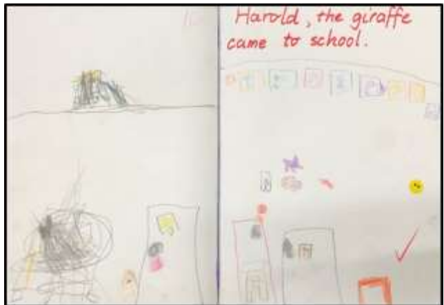
Harold the giraffe came to school.