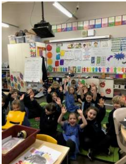
Merri class glad to be back!