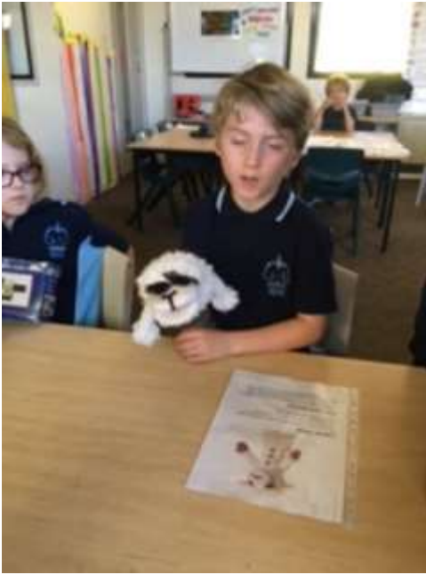
Murray with Lamb Chops the puppet from an old tv show.