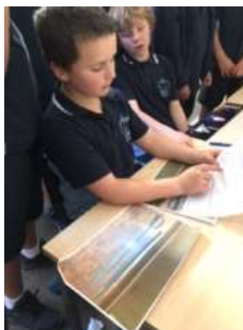
Charlie with a bayonet from WWI