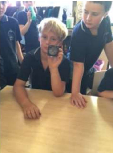
Tay with a clock and compass from WWII.