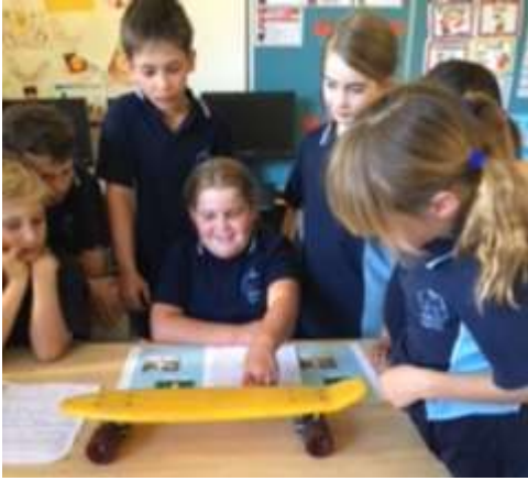
Coco with an old skateboard.